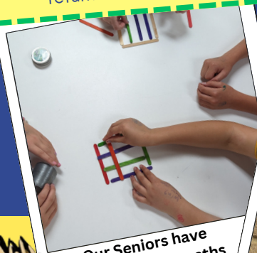
Our Seniors have explored team maths investigations