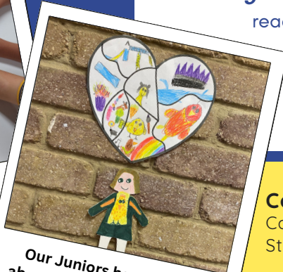
Our Juniors have thought about all the things they love

In our first session of Puggles last week we began to create a display of what we love about STAPS – and the list was very long! It included that we are an INCLUSIVE, CARING COMMUNITY , just like A BIG FAMILY, and that we love LEARNING, PLAYING, and BEING CURIOUS together.