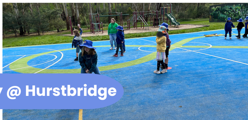
Relocation Day @ Hurstbridge