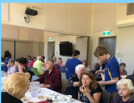
Cooking for, and Serving at, the Seniors High Tea