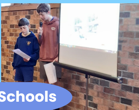
Leadership Day with Local Schools