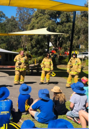
Drills with the CFA