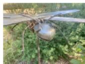
Lot # 1

Thank you to our amazing community for your donations and support