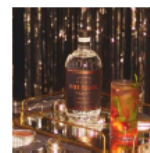
Lot # 14

Kinglake Distillery 500ml Single Malt Whisky ($100 value)