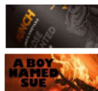
Lot # 9

Boy Named Sue $50 dinner voucher #1 & bottle of Punch wine